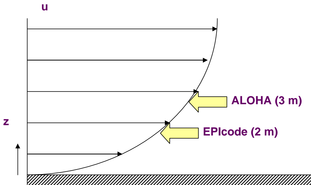
Figure 2. Atmospheric Wind Speed Profile – ALOHA and EPIcode Reference Heights for Atmospheric Transport and Dispersion Shown.

Both EPIcode and ALOHA use correlations of the following form to convert an input wind speed to a wind speed at the reference height [2, 9].